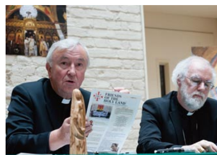
The Press Conference following the Conference at Lambeth