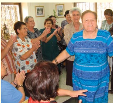
A sing-along at St Martha's House