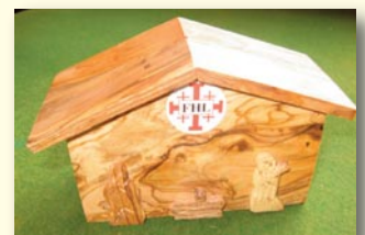
FHL Olive Wood Crib Box

Collect small change in your own olive wood crib box, available from your local FHL Group. They are collected once a year (or when full!) An ideal Christmas present .... and they are free! However we do expect to receive the contents-regularly!