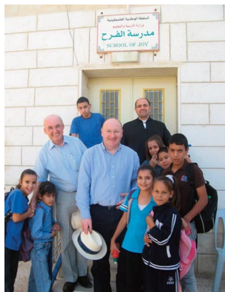
Some of the children at the School of Joy