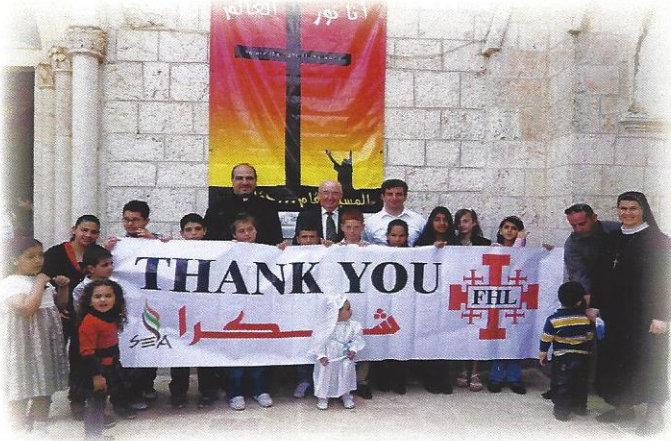
From the Sons of the Earth Association, an FHL Partner in the Holy Land “Thank you for your support at Easter”

“Working together to support the Christians in the Holy Land”