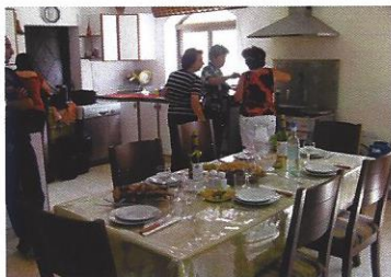
Lunch preparation in full swing at St Martha's

One of the many visible signs of donations from the "Friends" in the UK has been St. Martha's House, the first dedicated Day Care Centre for elderly ladies in Bethlehem. It is now well established as the regular meeting place twice a week for 35 ladies to enjoy friendship and a healthy lunch.