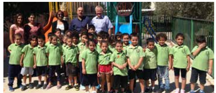
Children at the Arab Evangelical School in Ramallah where the Diocese of Europe supports some pupils.